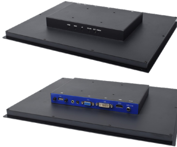
The actual appearance is subject to the final configuration