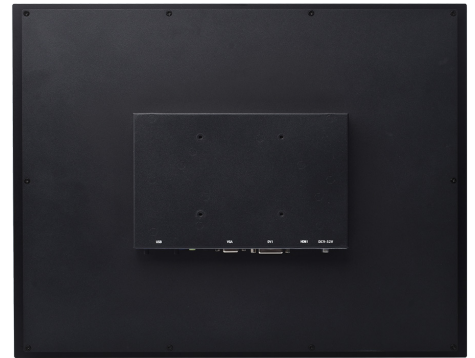
The actual appearance is subject to the final configuration