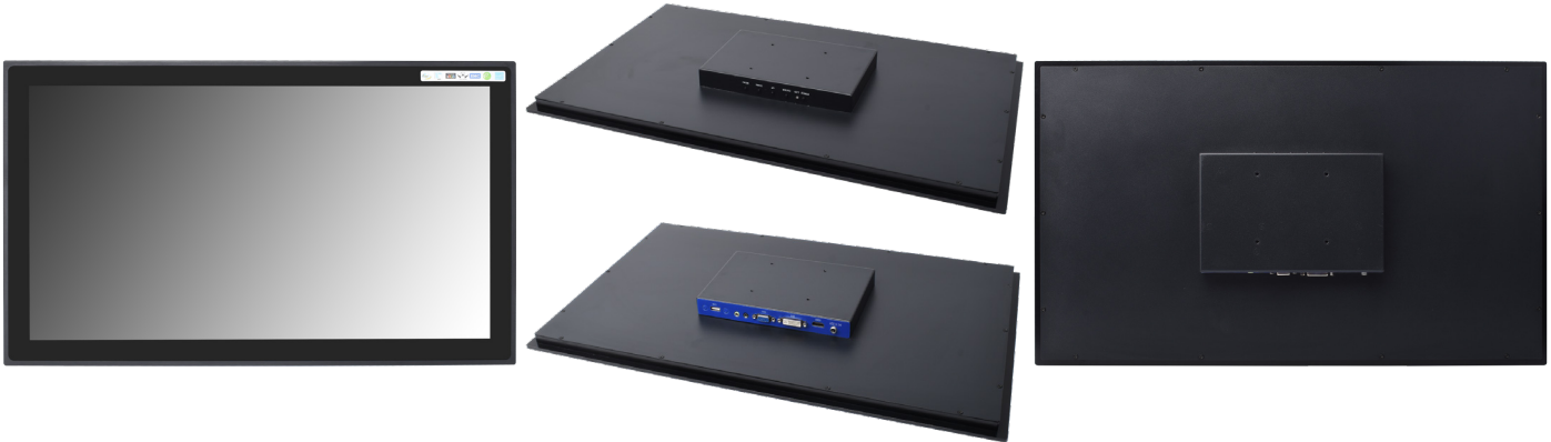
The actual appearance is subject to the final configuration