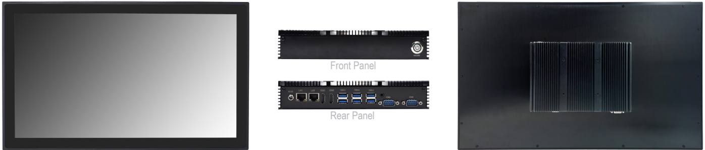
The actual appearance is subject to the final configuration