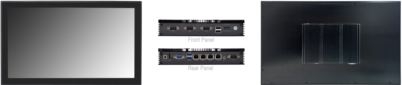
The actual appearance is subject to the final configuration