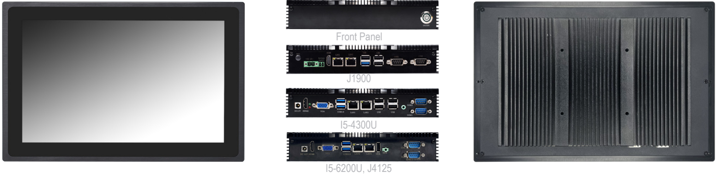
The actual appearance is subject to the final configuration